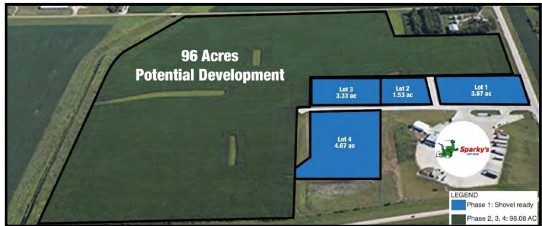
Business Park Development Sites

The Calhoun County Business Park project is spearheaded by a development team including the CCEDC, the Calhoun County board of supervisors, the Calhoun County Electric Cooperative Association (CCECA), and Corn Belt Power Cooperative (CBPC) in Humboldt. Through the years, CBPC has partnered in 25+ industrial parks with its member distribution