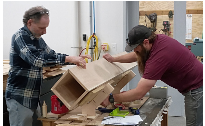
Each organ is uniquely designed and hand-crafted for the end user, making each organ a true work of art.