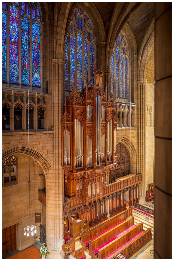
The Dobson Pipe Organ located at Saint Thomas Church, New York City.

Known for the beauty of their sound and their visual artistry, Dobson organs can be found in prominent institutions across America. The firm recently completed its largest instrument to date for St. Thomas Church in New York City, which has over 7,000 pipes. Other noteworthy organs can be found in the Cathedral of Our Lady of the Angels in Los Angeles, and Verizon Hall in Philadelphia's Kimmel Center for the Performing Arts, home of the world-renowned Philadelphia Orchestra. Closer to home, there are Dobson organs in 20 Iowa churches and on the Iowa State, Wartburg College, and Wartburg Seminary campuses. The firm has also restored a number of historic Iowa organs, including those for the Union Sunday School in Clermont and St. Wenceslaus Church in Spillville, famously played by the Czech composer Antonín Dvořák during his summer there in 1893.