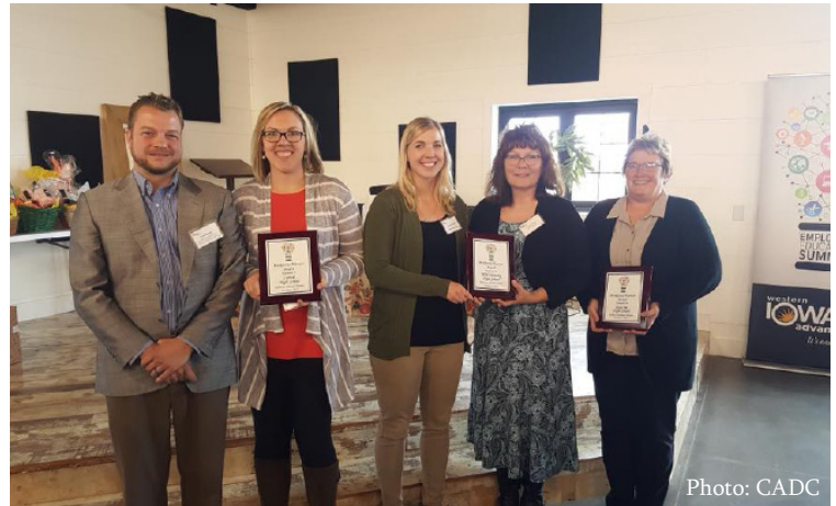
Above: Carroll Community Schools and IKM-Manning Community Schools, recognized as the 2017 Workforce Warrior Educators Below: New Hope Village, recognized for their collaboration efforts with the 2017 Workforce Warrior Award

New to this year's summit was the awarding of the Workforce Warrior awards. These awards promote collaborative efforts between local educators and businesses. Recipients were recognized for going above and beyond to work together. This year's school winners were: East Sac County High School for their School to Career Program, Carroll High School for their Employer/Educator Connection, and IKM-Manning for their STEM BEST FIRE Program. This year's business winners were: Crawford County Hospital for their RN Preceptorships, Eventide Lutheran Home for their Job Corps, WITCC & Denison Schools Partnership, and New Hope Village for their Rolling in the Fun, partnership with DMACC. Each of the award recipients received a small stipend for their efforts.