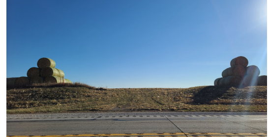
Future site of Corn Board Manufacturing, Inc.

McMahon Associates, Inc. (McMAHON), a full-service, professional engineering and architectural firm, is designing and overseeing the construction of a manufacturing plant for Corn Board Manufacturing, Inc. The facility, which will be located in Sac County, Iowa, will be used to convert corn stover biomass – leaves, stalks and husks – into an environmentally-friendly wood alternative called CornBoard™. The CornBoard™ product will be used to make pallets that weigh less but have the same, if not stronger, structural integrity as traditional wood pallets.