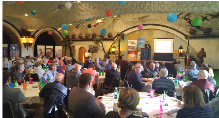
Evan Blakley provides attendees with a summary of WIAD’s activities over the past year.